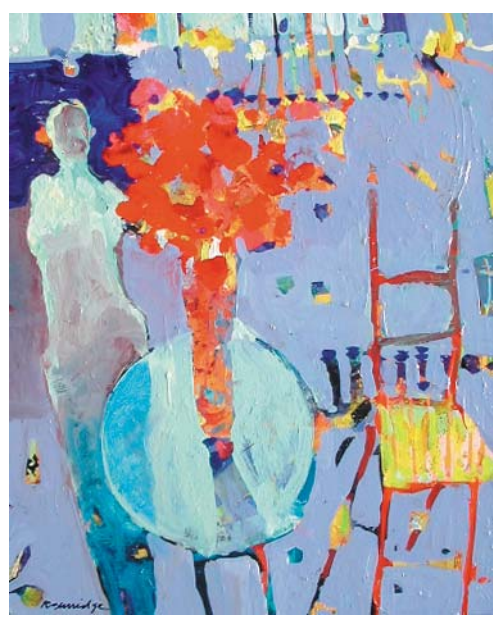
Atelier, 16" x 20", mixed media on canvas