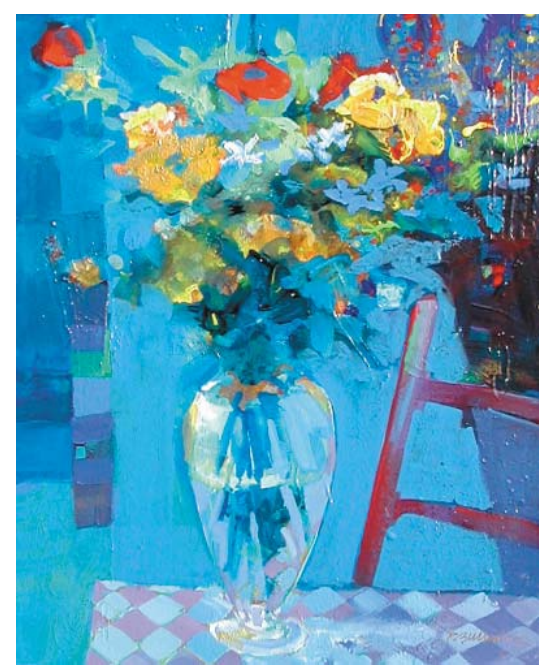
Portico, 16" x 20", mixed media on canvas