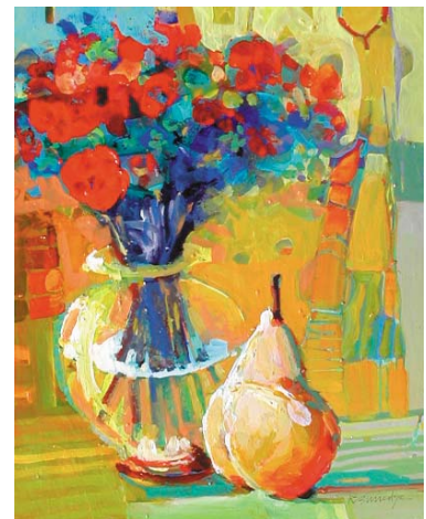
Solarium, 16" x 20", mixed media on canvas