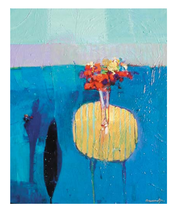
Undercover, 24" x 30", mixed media on canvas