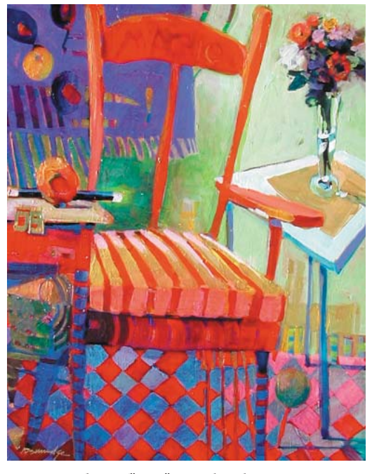
Magician's Chair, 24" x 30", mixed media on canvas