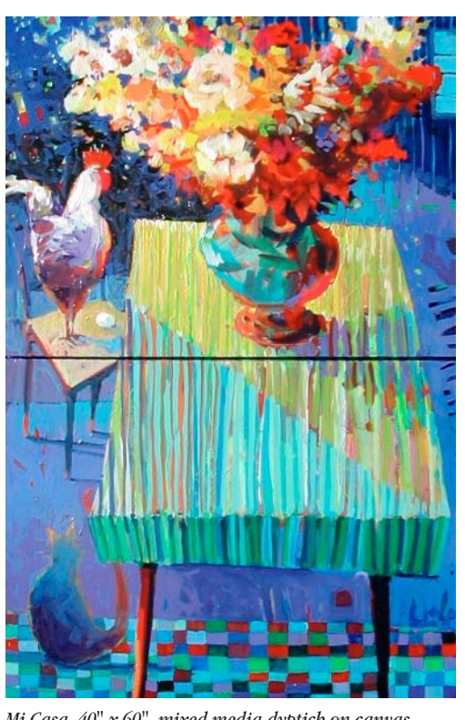
Mi Casa, 40" x 60", mixed media dyptich on canvas

Still Life... for me, these two words never made sense together. "Still Life" contradicts itself.