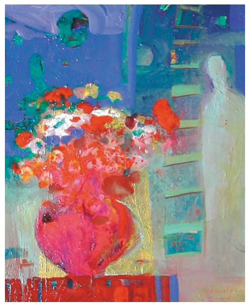
Private Chamber, 16" x 20", mixed media on canvas