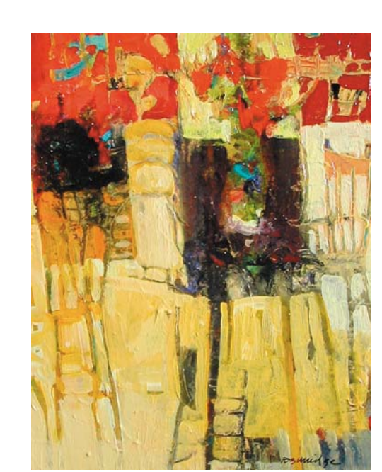
Play Room, 16" x 20", mixed media on canvas