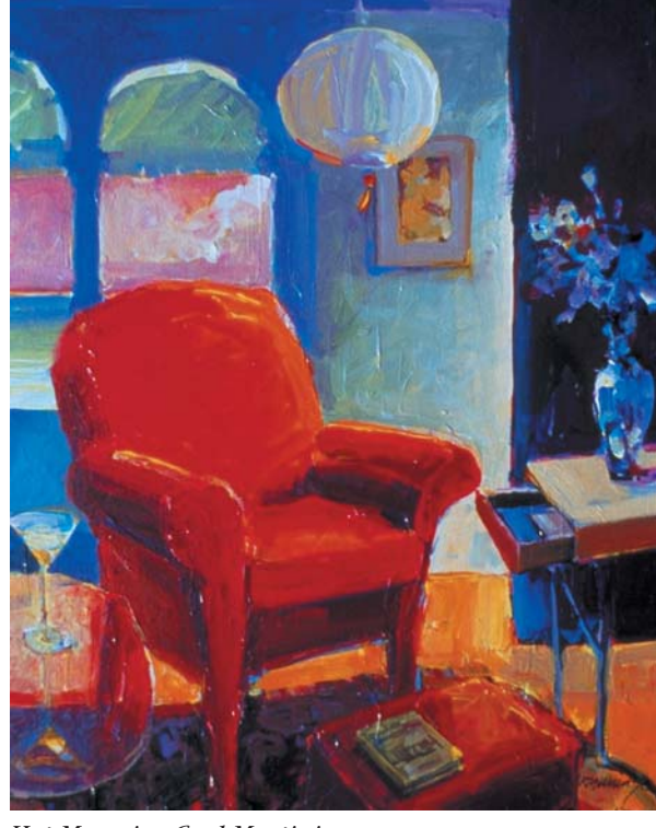
Hot Memoirs, Cool Martini