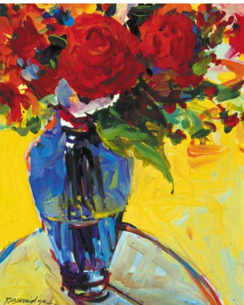
Red Flowers in Blue Vase