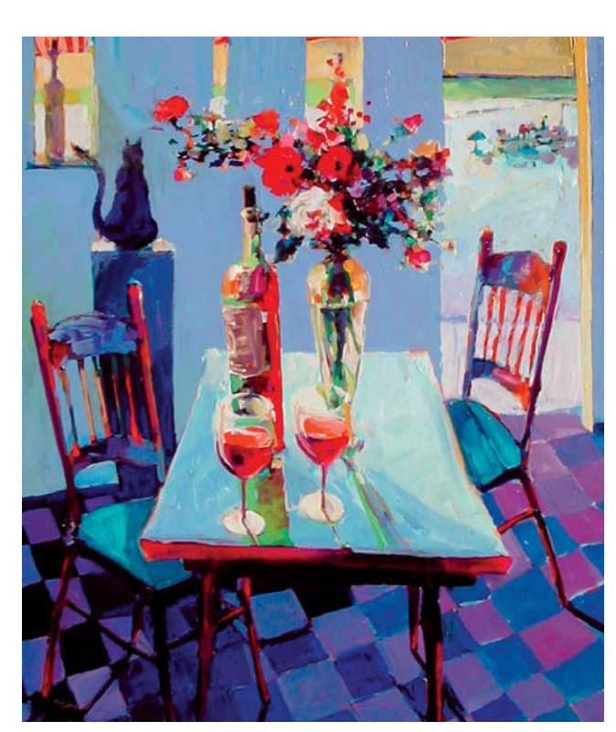
Basking in Sunlight