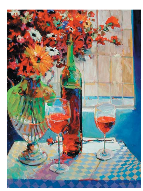
Table for Two